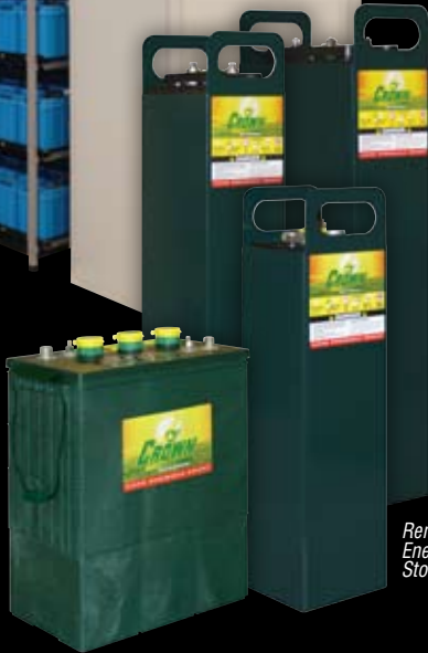
Renewable Energy Storage