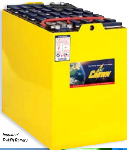
Industrial Forklift Battery

We are represented by MORE factory-authorized, independently motivated industrial battery sales and service centers in North America than anyone else. Therefore, you know your investment in Crown Batteries is properly installed, configured and set up for MORE years of “less-hassle” power for your equipment. That means MORE uptime, MORE moves, MORE support for MORE value and guaranteed satisfaction.