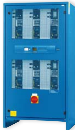
Industrial Battery Charger