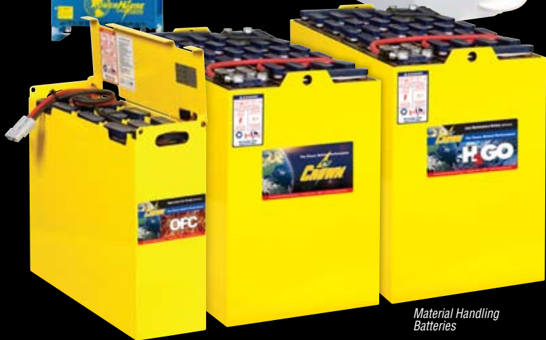
Material Handling Batteries